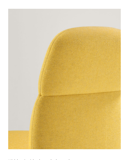
Hidden inside the upholstered curves are innovative ergonomics, including our patented PostureFit.

The Asari Chair by Herman Miller is beautiful in its simplicity, with a form that welcomes you with its gentle curves and upholstered frame. Hidden inside are innovative ergonomics. Layered, contoured foam provides the initial comfort you get from an upholstered chair with the long-term benefits you expect from task seating. PostureFit, which adjusts to the lower back's contours, fills the void that exists between the lower back and the back of the chair—all while promoting the natural alignment of the spine. Tailored for you, a synchronous, self-adjusting tilt provides natural movement, while the seat pad minimizes pressure points and provides support.