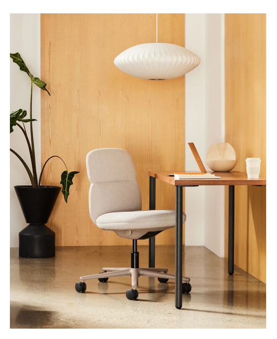
The Asari Chair by Herman Miller is a study in duality: sculptural form and everyday function, upholstered and ergonomic, quiet and significant.