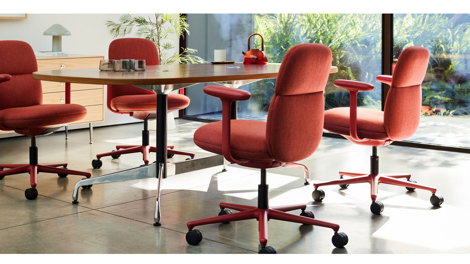
Fukasawa compared these chairs around dining or meeting tables as a gathering of friends.